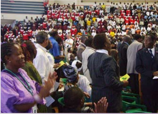
A partial view of the assembly in Maputo.